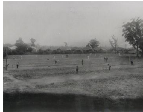
MHS looking toward Nelson St. PW 001/001380 c.1910