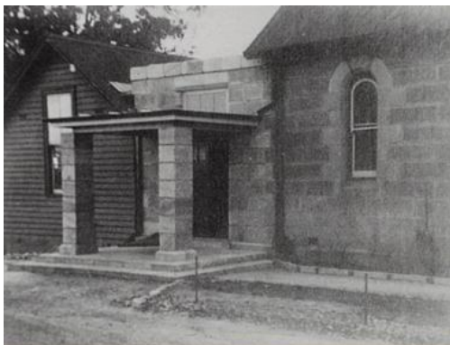
Classroom between the 'Chapel' (shown on right) and the main school building to the west. PW 6536/6536545