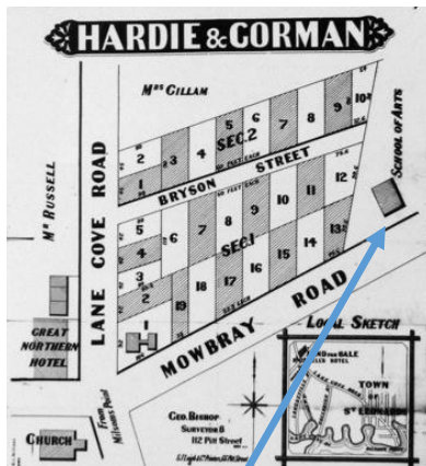
School of Arts c.1897 PW 010/0010981 Fig. 3