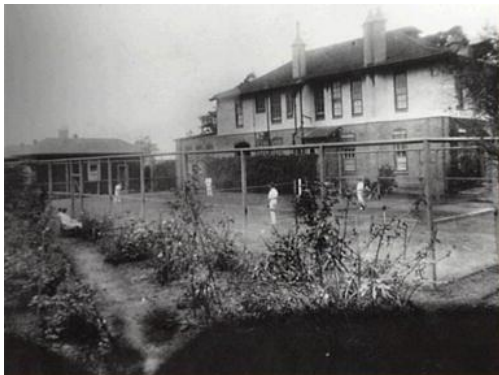
Tennis courts at rear of house PW 6537/6537992