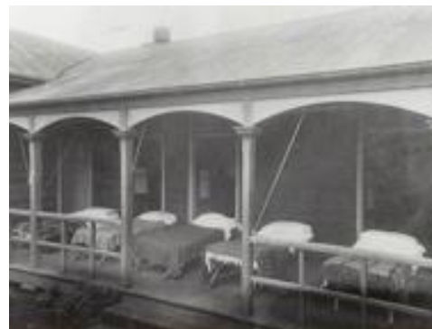
Master's Cottage with external boarder's dorm. PW 6536/6536532