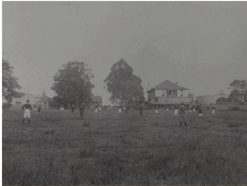
Playing fields behind the school PW 6537/6537997