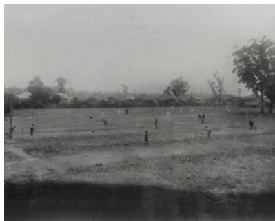
Chatswood Preparatory School c.1910 PW 001/001380 Fig. 5

that the Government should place a sum of money of the estimates for the purpose of enabling the Professors of the University to visit the various Schools of Arts throughout the colony for the purpose of delivering lectures. [Source: Evening News, 1875 (May 12) p.2]. The School of Arts operated for two years. In 1877 Willoughby Municipal Council rented the building for use as Council Chambers. Council purchased the building in 1879 and it remained in use as Council Chambers until 1903. After the Council takeover of the building, the School of Arts became defunct, although the building itself continued to be known as the School of Arts. It was a fine sandstone building which in 1957 was moved to Beaconsfield Road to become the Church of the Holy Trinity after being used as a school chapel for a number of years.