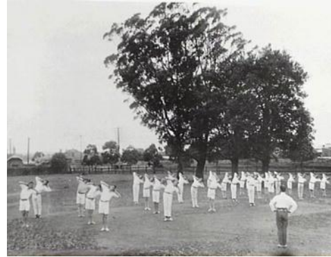
Exercise yards of the Mowbray House School PW 6538/6538373