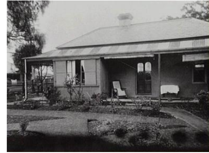
'Penzance' n.d Cnr. Mowbray Rd & Orcard RD PW 6536/6536528 Fig. 9

The site of what was to become Mowbray House School is shown in the accompanying diagram. We know that the School of Arts/Council Chambers that was removed to Beaconsfield Rd was to the east of 'The School'. This leaves the area between 'The School' and where 'Belrose' stood. It is clear in many photographs looking toward Nelson St there were substantial playing fields behind and next to the school. So it appears the school site