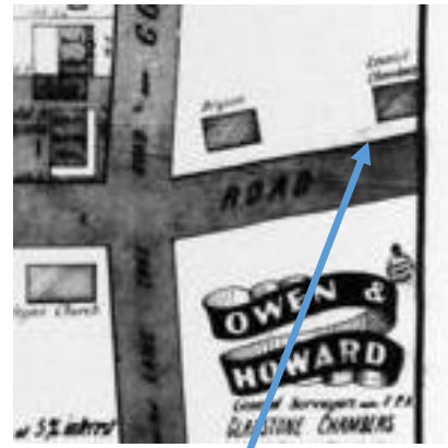
Council Chambers 1895 PW 0010/0010555 Fig. 4