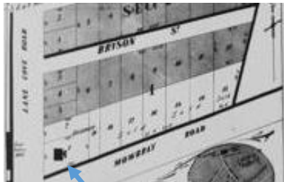
'Belrose' Cnr. Mowbray Rd & Gordon Rd PW 0010/0010187 Fig. 1