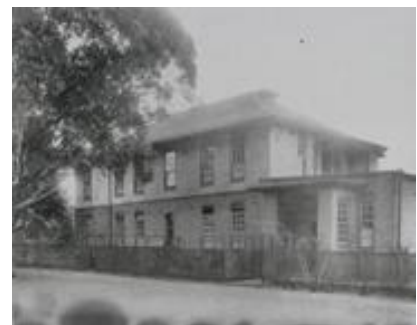
Mowbray House School 1930s PW 003/003317 Fig. 6

In 1906 the Chatswood Preparatory School opened in a new building next door to the old School of Arts building. In 1914, the name of the school was changed to Mowbray House School. The building is still standing opposite Hampden Rd. It is acknowledged by a Heritage Plaque in the footpath outside. The original School of Arts Building that had become the Council Chambers finally became the school chapel until it was removed to the corner of Dalrymple Ave and Beaconsfield Rd in 1957 to be used as the Holy Trinity Church.